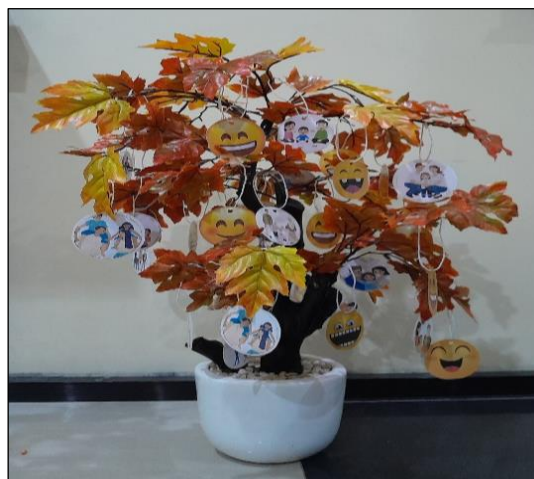
Figure 6. Good Treatment

The Tree of Life method not only enhances understanding and awareness but also succeeds in strengthening the emotional bond between children and parents. In the educational process, students are given the opportunity to choose images of parenting experiences that they have encountered.