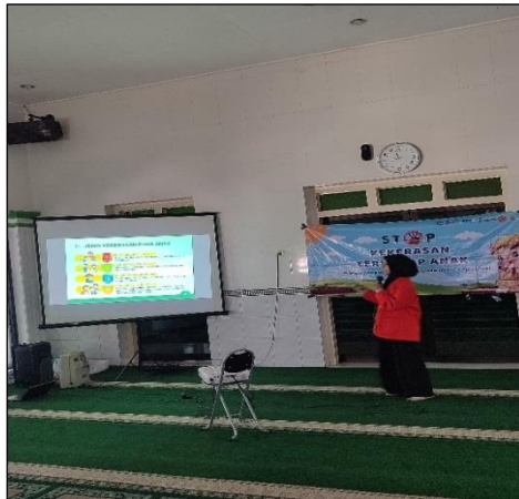
Figure 5. Parent Education

The Tree of Life method not only enhances understanding and awareness but also succeeds in strengthening the emotional bond between children and parents. In the educational process, students are given the opportunity to choose images of parenting experiences that they have encountered.