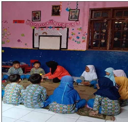
Figure 2. Aircraft Quiz

Aircraft Quiz is an interactive learning method specifically designed for preschool children. This method uses airplane-themed games to help children answer questions related to pre-tests and post-tests about violence against children. With a fun and visual approach.