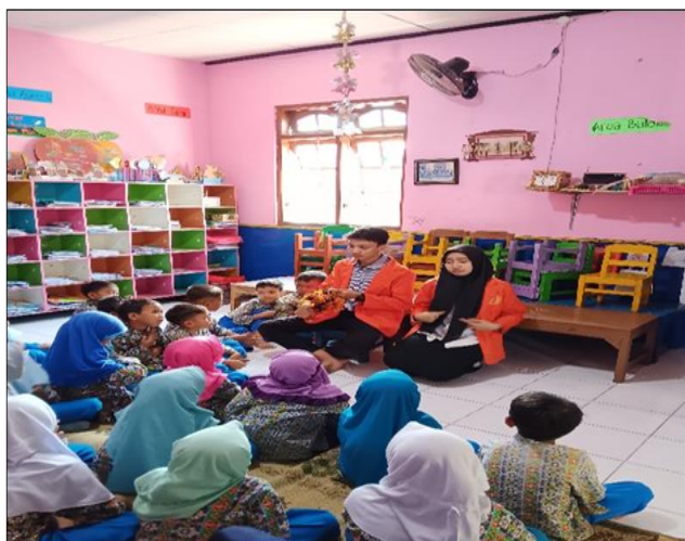
Figure 7. Student Education

This educational program was successfully implemented at the Islamic Kindergarten Bakti Sawahan, thanks to the active participation of students, parents, and teachers. After the program concluded, the school plans to continue using the Tree of Life method in daily learning activities and integrate it into the curriculum. To maintain the sustainability of the program, the school will conduct periodic evaluations to ensure that the material provided remains relevant and is understood well by both parents and children.