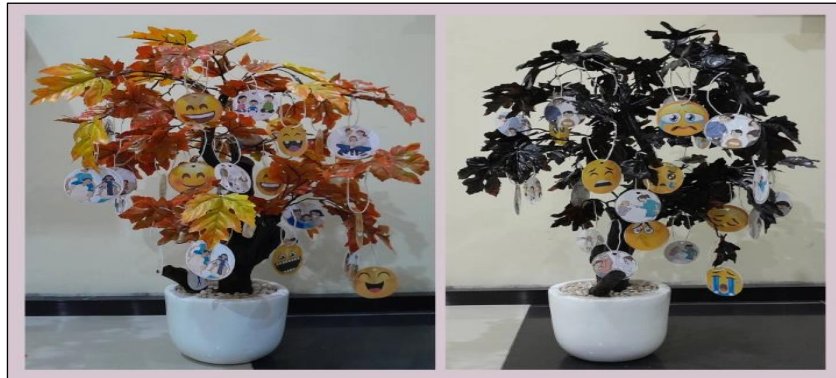
Figure 1. Tree of Life

Aircraft Quiz is an interactive learning method specifically designed for preschool children. This method uses airplane-themed games to help children answer questions related to pre-tests and post-tests about violence against children. With a fun and visual approach.